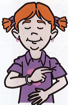
and of the Holy...