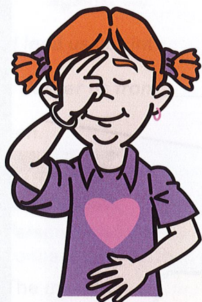
In the name of the Father,

This prayer honors the Holy Trinity. We use this all the time, like during Mass and when we bless ourselves with holy water. We say: In the name of the Father, and of the Son, and of the Holy Spirit while touching our forehead, chest, and shoulders. Then we say: Amen and bring our hands together. Watch your teacher and then try it on your own!