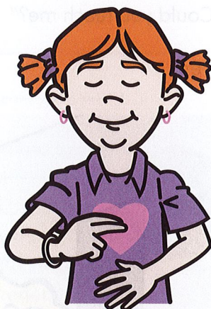
and of the Son,